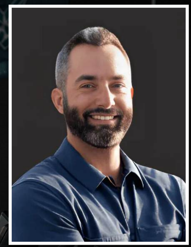
Gym Launch CEO